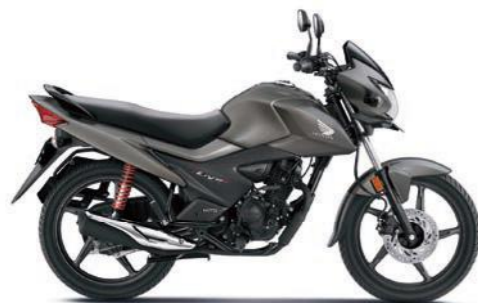
MATT CRUST METALLIC